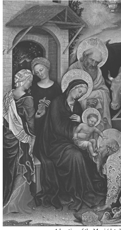
Adoration of the Magi (detail) Gentil de Fabriano, 1423