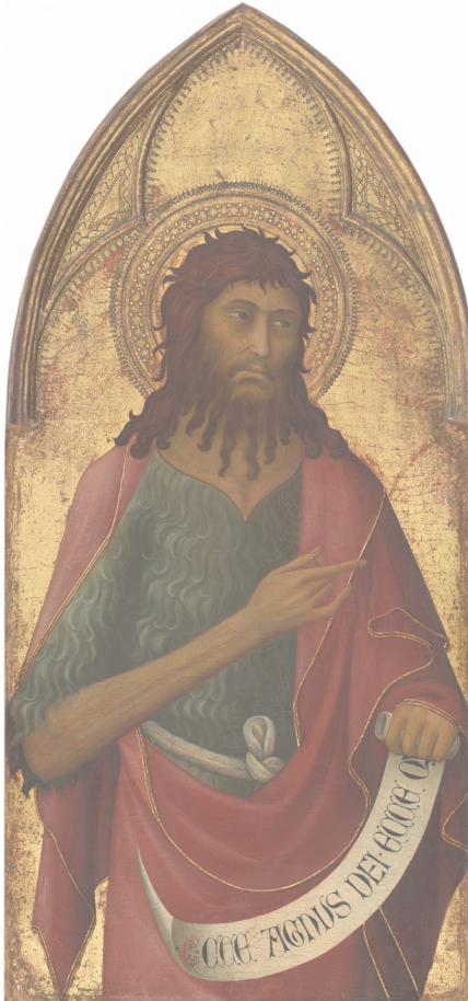
Saint John the Baptist, altarpiece panel Lippo Memmi, (c.1325)