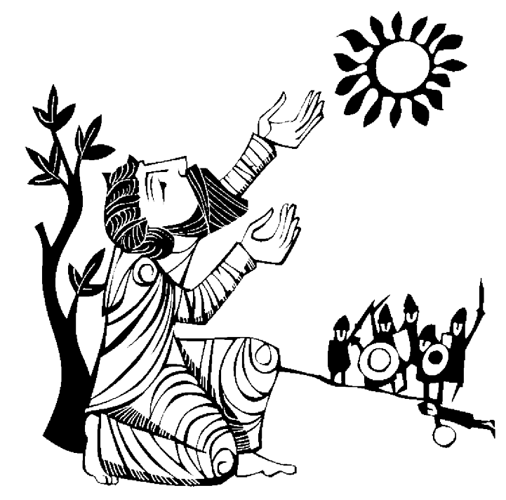
"Our help is from the Lord." Psalm 121