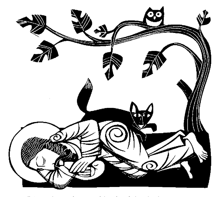
"Foxes have dens and birds of the sky have nests, but the Son of Man has nowhere to rest his head." Luke 9:58