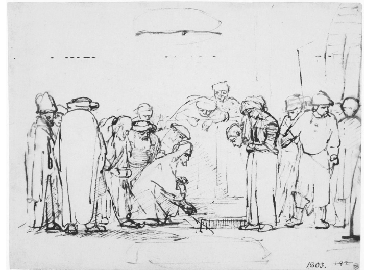
Christ and the Woman Taken in Adultery c. 1650-55 Rembrandt