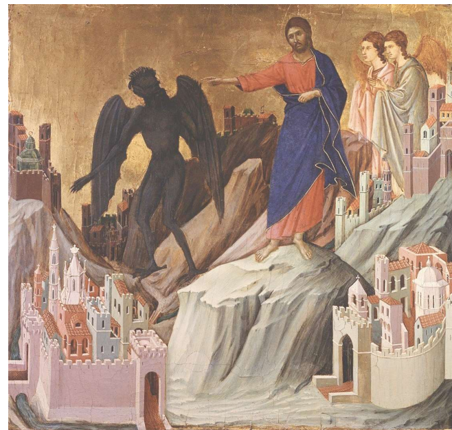
The Temptation on the Mount Duccio (1308-1311)