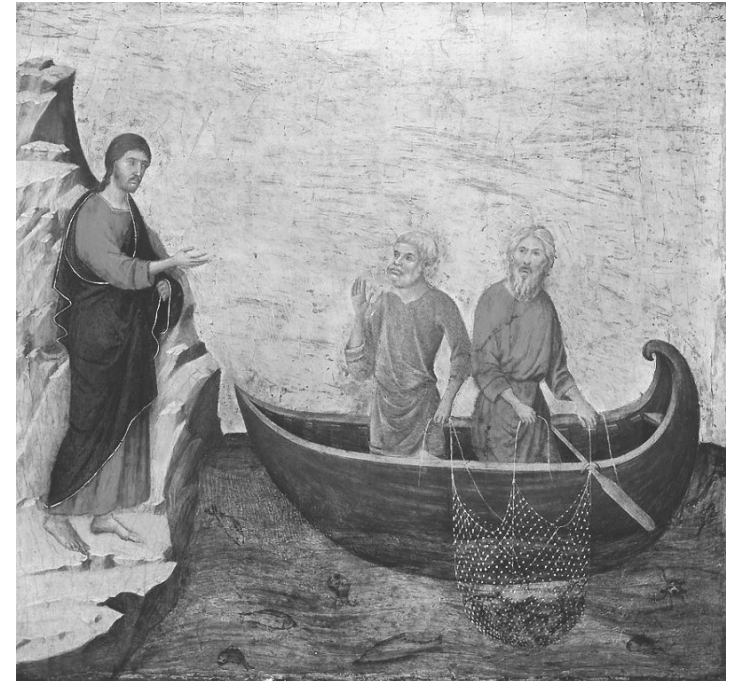
The Calling of the Apostles Peter and Andrew Duccio (1308-1311)