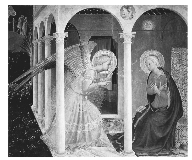
The Annunciation Fra Angelico (1433-34)