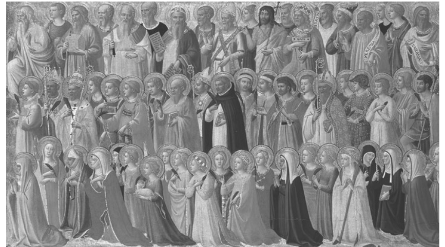
Forerunners of Christ with Saints and Martyrs Fra Angelico (1423-1424)