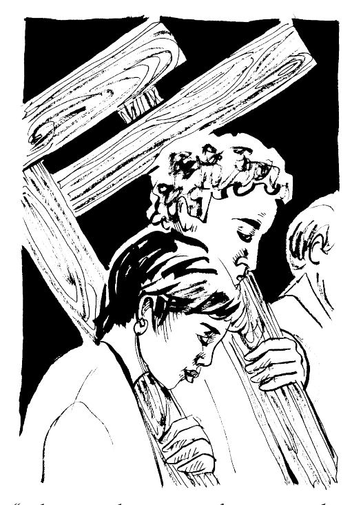
"Whoever wishes to come after me must deny himself, take up his cross, and follow me." Mark 8:34