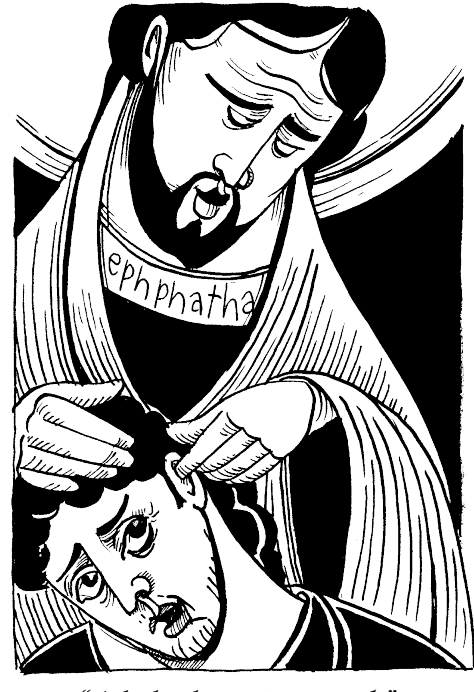
"Ephphatha! – Be opened!" Mark 7:34