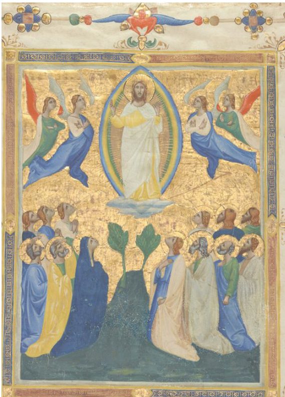
The Ascension of Christ Laudario of Sant' Agnese, Pacino di Bonaguida, c. 1340