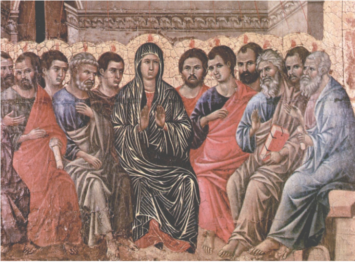
Pentecost , Panel from the Maesta Altarpiece of Siena, Duccio di Buoninsegna (1308-1311)