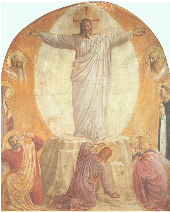
The Transfiguration Fra Angelico (1440-1442)