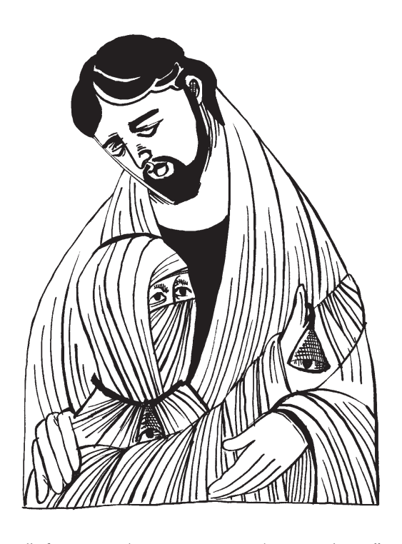
"If you wish, you can make me clean." Mark 1:40