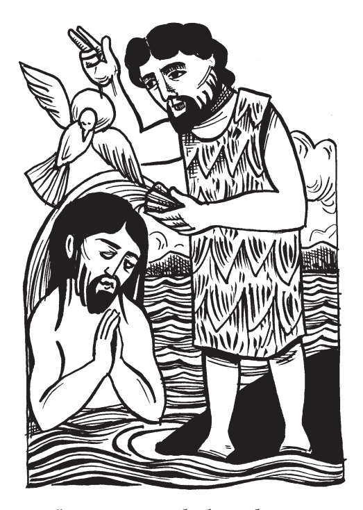
"You are my beloved Son; with you I am well pleased." Mark 1:11