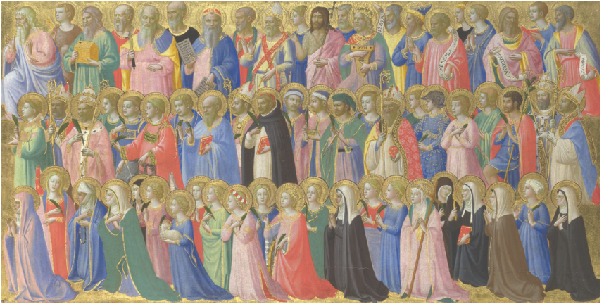
Forerunners of Christ with Saints and Martyrs Fra Angelico (1423-1424)