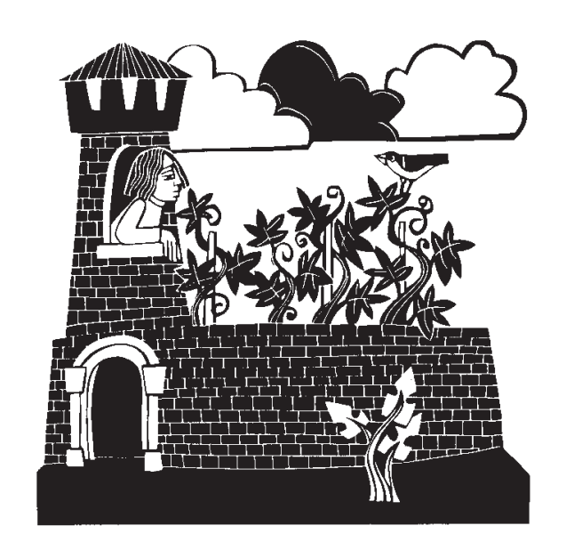
"The vineyard of the Lord is the house of Israel." Psalm 80:9

The Twenty-Seventh Sunday in Ordinary Time