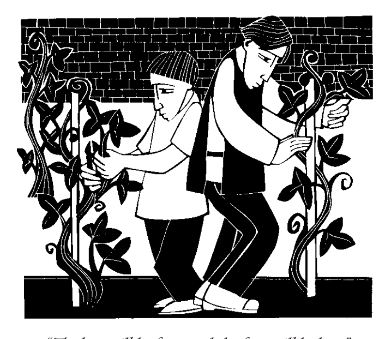
"The last will be first, and the first will be last." Matthew 20:16

The Twenty-Fifth Sunday in Ordinary Time