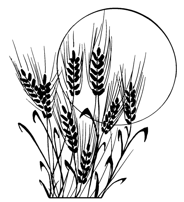
The righteous will shine like the sun.