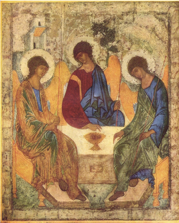
Holy Trinity , icon Andrei Rublev (1400)