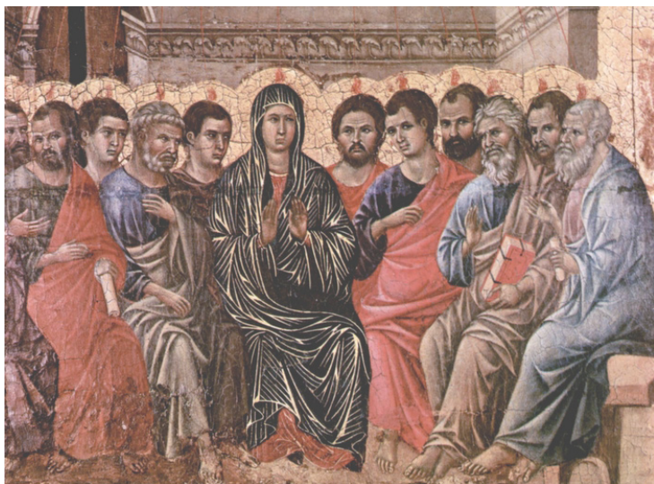
Pentecost , Panel from the Maesta Altarpiece of Siena, Duccio di Buoninsegna (1308-1311)