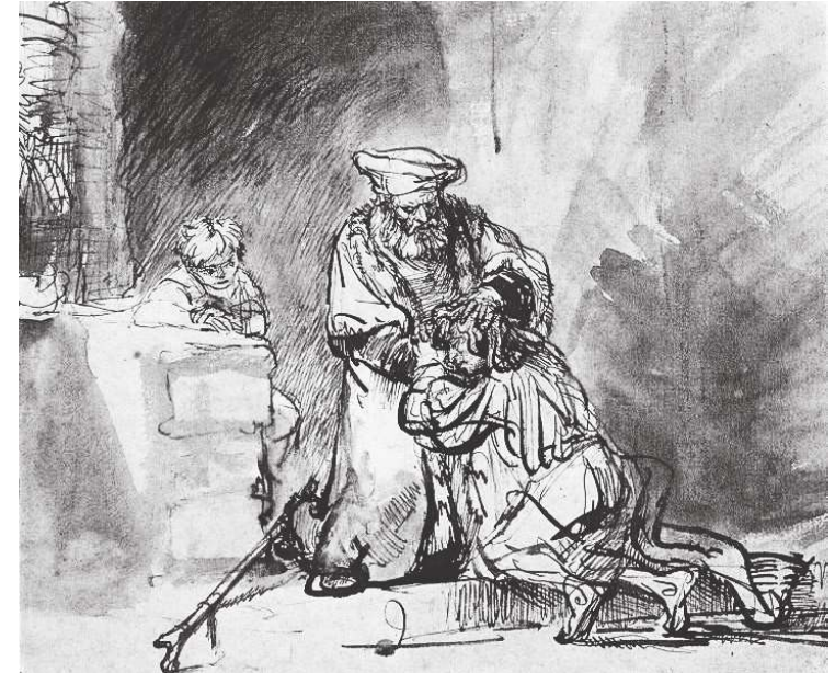
The Prodigal Son, Rembrandt (1642)