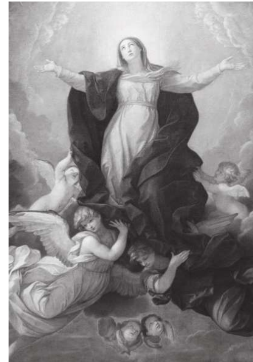
The Ascension of the Virgin Guido Reni (1642)