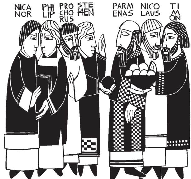
Los primeros diáconos

Pregunta de la Semana: Con la fortaleza que nos dan la palabra y la Eucaristía de hoy, ¿qué clase de creatividad y comprensión puedo ofrecer a fin de trazar un camino hacia la resolución de alguna situación o relación conflictiva?